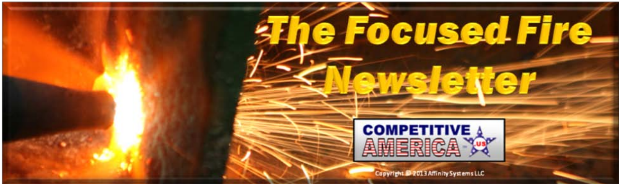
The Focused Fire Newsletter - Copyright © Affinity Systems LLC, September, 2014 Issue 15